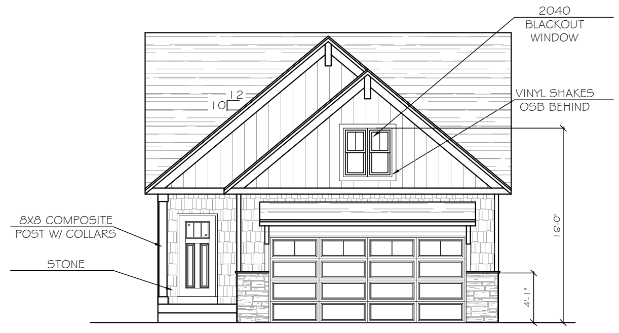
FRONT ELEVATION 1/8" = 1'-0"