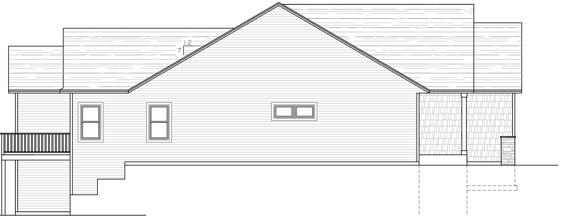
LEFT ELEVATION 1/8" = 1'-0"