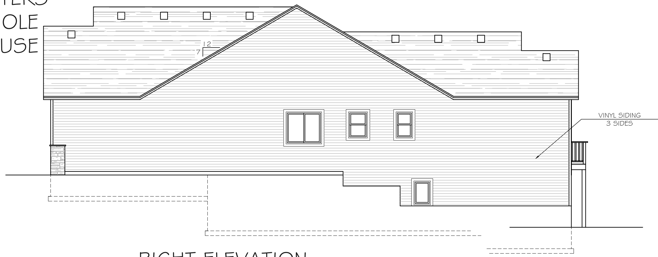
RIGHT ELEVATION 1/8" = 1'-0"