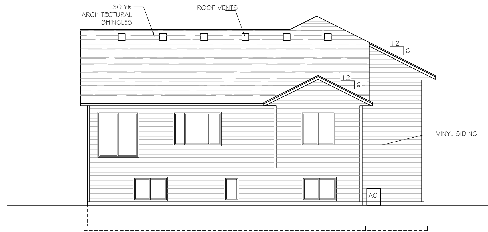
REAR ELEVATION SCALE: 1/8" = 1'-0"

Intellectual property of Fieldstone Family Homes, Inc. © 2008. ALL RIGHTS RESERVED. These plan drawings, including but not limited to, all text, designs, renditions, floor plans, along with the selection and arrangement of thereof, are original copyrighted materials owned by Fieldstone Family Homes, Inc. These materials are protected by federal law against unauthorized copying, or reproduction by unauthorized persons and entities. MN LIC: BC631164 WI LIC: DC-070800080