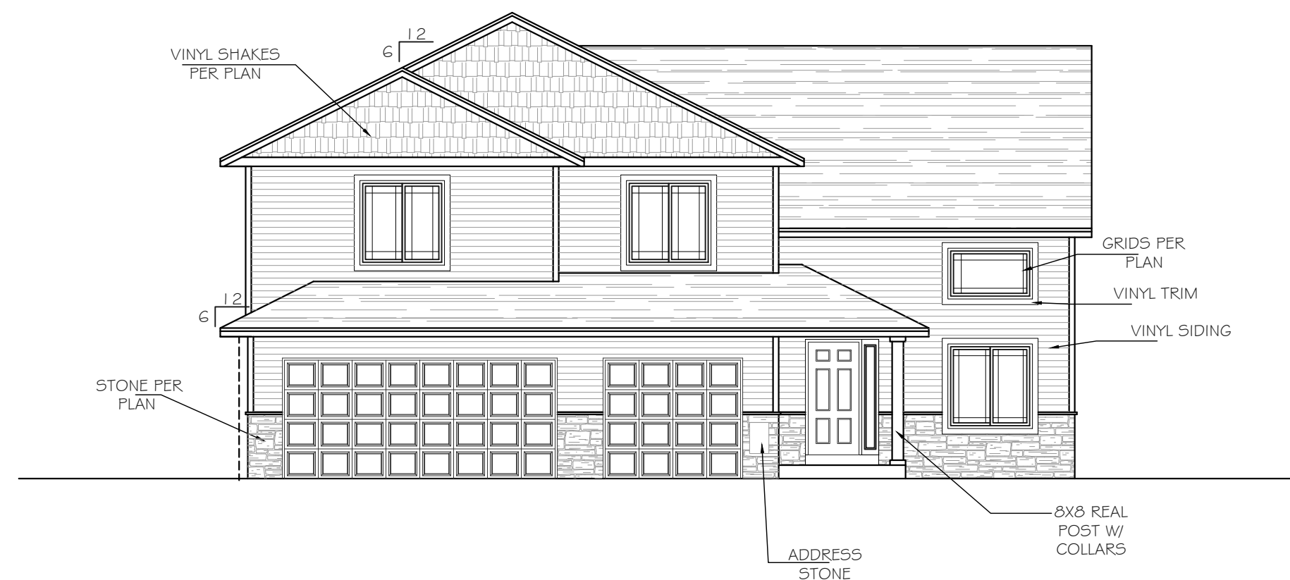
FRONT ELEVATION SCALE: 1/8" = 1'-0"