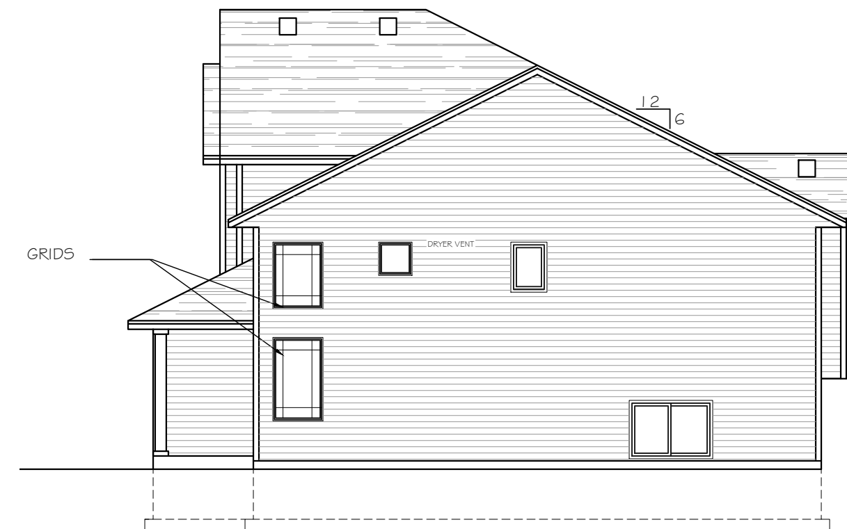
RIGHT ELEVATION SCALE: 1/4" = 1'-0"